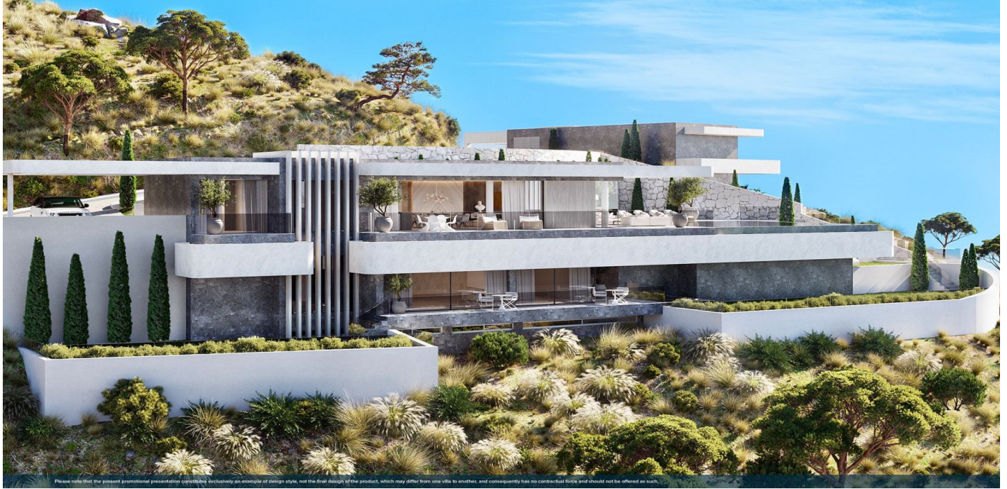
Please note that the present promotional presentation constitutes exclusively an example of design style, not the final design of the product, which may differ from one villa to another, and consequently has no contractual force and should not be offered as such.

Reference: R3687095 Bedrooms: 3 - 4 Bathrooms: 3 - 4 Plot Size: 1,337m 2 - 3,220m 2 Build Size: 642m 2 - 733m 2 Terrace: 88m 2 - 132m 2